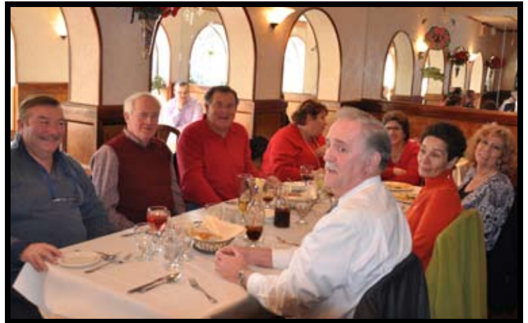
Everyone enjoying themselves while catching up and sharing holiday wishes